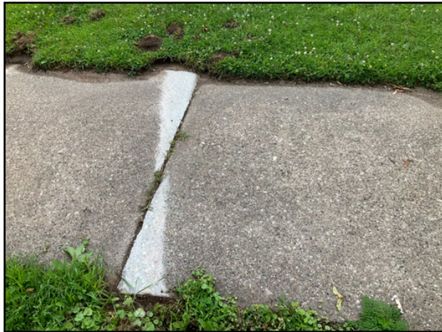
Sample Repair Photo: Defect 110 repaired on 07/24/2025 at 146 12th St, N at 9:01 AM

Completed repair photos and timestamps help ensure repair quality